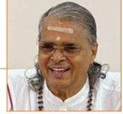
Swami Sri Atmananda Satyachetana Ashram, Thiruvannamalai